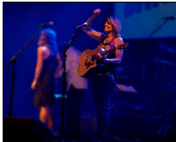
2 Fillmore Silver Spring, 2016